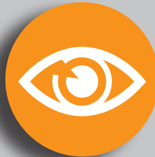
Limited Visual Acuity