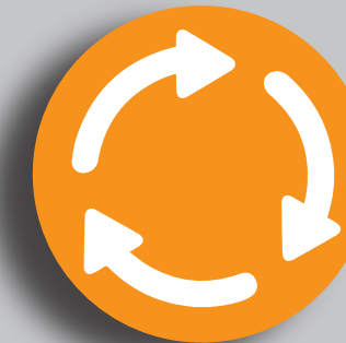
Long, Repetitive and Monotonous Tasks