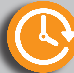
Tasks Over Long Periods of Time